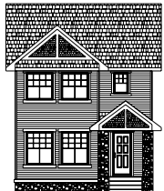
English Cottage Elevation