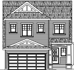
Arts & Crafts Elevation