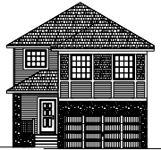
English Cottage Elevation