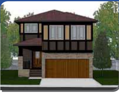
Artists rendering. May not be exactly as shown.