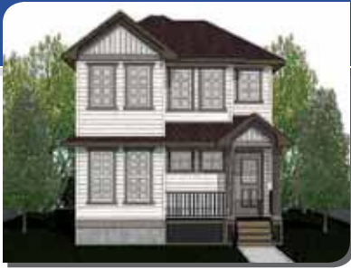
Artists rendering. May not be exactly as shown.