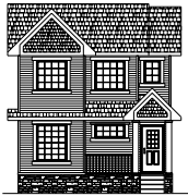
English Cottage Elevation