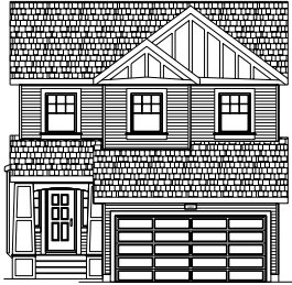
Arts & Crafts Elevation