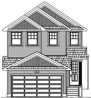
Georgian Colonial Elevation