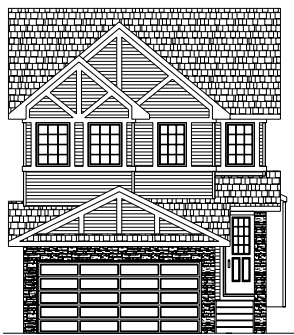
Georgian Tudor Elevation