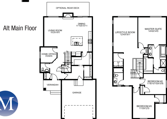
Alt Main Floor