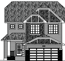
English Cottage Elevation